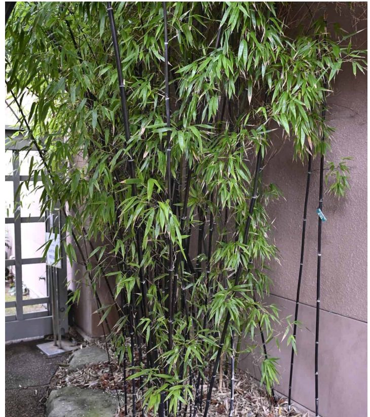
Phyllostachys nigra 'Black Bamboo' grown against a foundation and contained by a sidewalk at the Elisabeth C. Miller Library in Seattle. In this shady contained location, it will not grow to its unconstrained height of 35'.