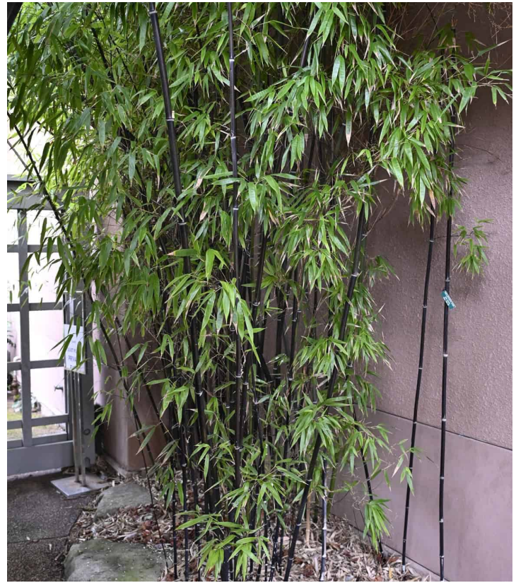
Phyllostachys nigra 'Black Bamboo' grown against a foundation and contained by a sidewalk at the Elisabeth C. Miller Library in Seattle. In this shady contained location, it will not grow to its unconstrained height of 35'.