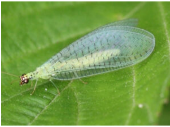
Lacewing insect

The lace bug is not to be confused with lacewing insects ( Chrysoperla species) which are native to the Pacific Northwest and important natural predators providing biological control of aphids.