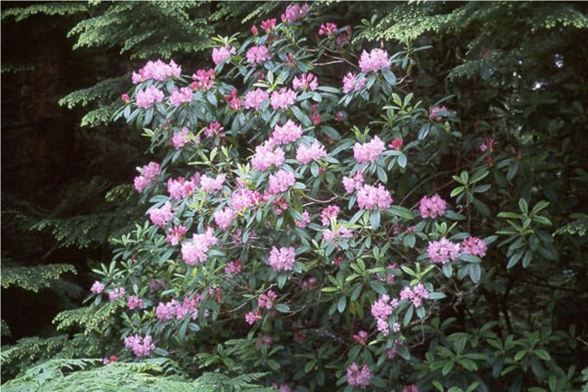
The Western or Pacific rhododendron is native to the woodlands of the Pacific Northwest.

World Climate Conference declared climate change a global issue, and rhododendron gardeners' concern turned to the native Western rhododendron and its environment, along with concern for their rhododendron species and hybrids from afar. The natural environment of the Pacific Northwest, so well suited for much of the genus Rhododendron , was becoming jeopardized by temperature increases and other disturbances to its blissful climate.