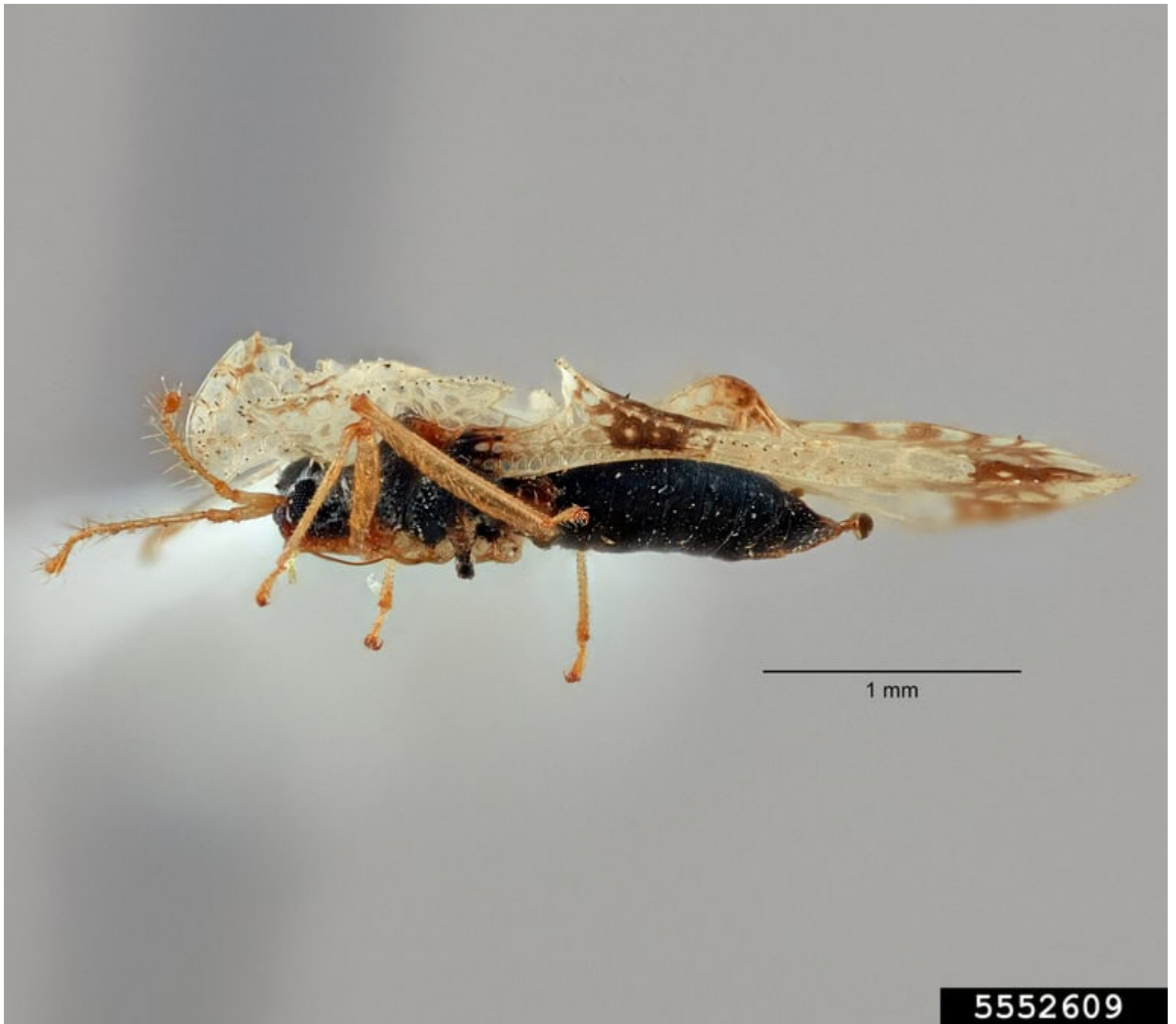
Rhododendron lace bug ( Stephanitis rhododendri Horvath)