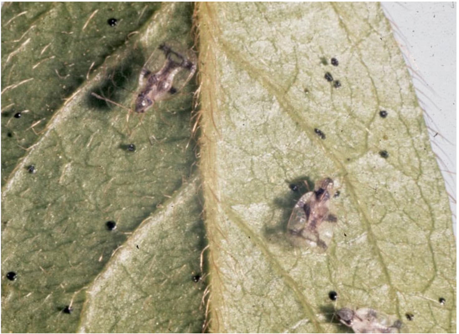
Azalea lace bug ( Stephanitis pyrioides )

The lace bug affected rhododendrons with small leaves, mainly in the island meadow section of the Rhododendron Garden, namely hybrids 'Ramapo,' 'Ginny Gee,' and 'Patty Bee.'